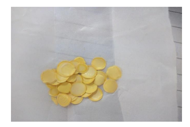
Figure 4: Formulation F4