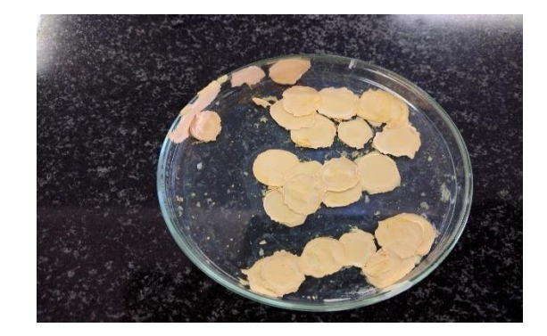
Figure 2: Formulation F2