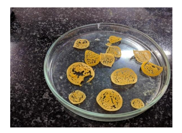
Figure 3: Formulation F3