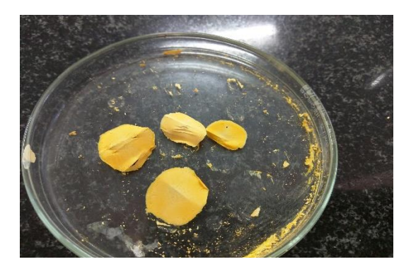
Figure 1: Formulation F1