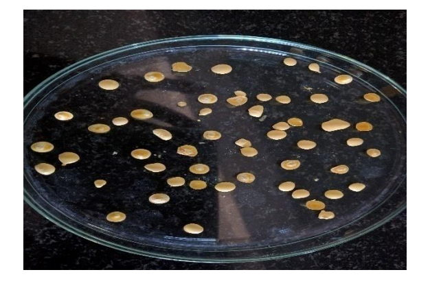
Figure 7: Formulation F7