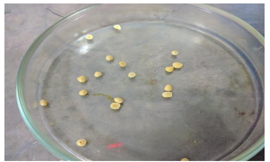
Figure 5: Formulation F5