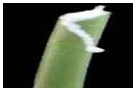
Fig 2: Latex of Cynanchum acidum [9]