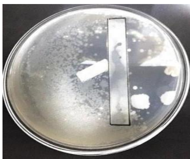
Figure 2. The results of the Bioautography of fraction ethilacetat to the Pseudomonas aeruginosa

The ethyl acetate chromatography plate was then placed on the surface of the agar media which had been inoculated with the Pseudomonas aeruginosa bacteria, left for 30 minutes, then the chromatography plate was removed and removed from the surface of the medium. After making observations there is a clear zone on the media so that it indicates the presence of inhibition against the tested bacteria. In this monitoring, the Rf is 0.81. The spots are proven to inhibit the growth of the tested bacteria. The compounds that play a role in antibacterial activity are thought to be tannin.