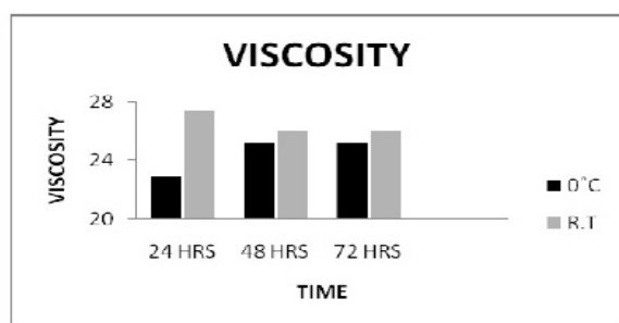
Figure 3. Viscosity of syrup in different time intervals