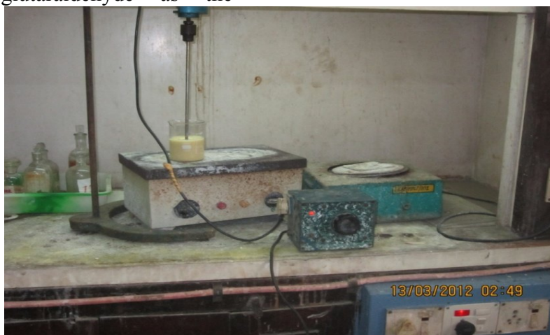
Fig 1: Preparation of fish gelatin nano particle

crosslinking agent was found to be highly stable in water. The sediment obtained after first desolvation step mainly possessed the high molecular weight fish gelatin, while the supernatant which was removed, was containing portions of gelatin. The purpose of removing gelatin of low molecular weight was to avoid wider distribution of gelatin, which may not only cause formation of irreversible aggregates after crosslinking, but also form unstable particles. Acetone slowly added to protein solution acts as the desolvating agent. With the addition of acetone, a change occurs in the third structure of protein. When a certain level of desolvation was reached, protein clump was formed. In the next stage, nanoparticles were obtained when cross linked with glutaraldehyde. In order to obtain dispersed nanoparticles, we must stop the system before particles start to accumulate. System turbidity will be increased owing to the desolvation factor. Particles started to accumulate when the turbidity of the system were increased.