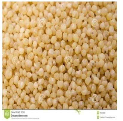
Fig 1: Seeds of Echinochloa frumentacea

Kingdom : Plantae Clade: Angiosperms Clade: Monocots Clade: Commenlinids Order: Poales Family: Poaceae Sub-family: Panicoideae Genus: Echinochloa . Species: E.frumantacea . Binomial Name: Echinochloa frumentacea .