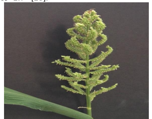
Fig 3: Twig of Echinochloa frumentacea Growth and Development

days. Flowers open from 5 to10 am with maximum number of flower opens between 6 and 7 am [16]. In the individual raceme, the flowering first starts at marginal ends and then proceeds to the middle of the raceme. The flowers are hermaphrodite (have both male and female organs). Before the anthers dehiscence, the stigmatic branches spread, and flower opens [17].Late season florets are cleistogamous (not opening) [18]. It is primarily self-pollinating [19] and selfcompatible. Some degree of out crossing recorded which was facilitated by wind pollination. Echinochloa frumentacea has smaller awn less spikelet's, with membranous glumes in comparison with large usually awned spike lets and cretaceous upper glumes and lower lemma [20] in E.esculenta. Based on inflorescence morphology, the species E.frumentacea was classified into four races namely Stolonifera, Intermedia, Robusta and Laxa. Similarly, E.utilis (Syn. E.esculenta) was classified into two races namely utilis and intermedia. The mean diploid 2C DNA content of barnyard millet is reported to be 2.65–2.7 [21].