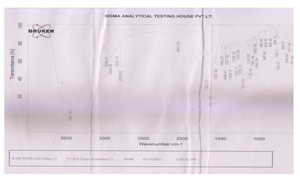
Figure 3: FTIR of Repaglanide with crosspovidone