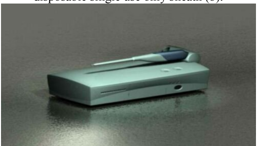
Figure 1 (a)

Figure 1: Truscreen optoelectronic device (a) and disposable single use only sheath (b).