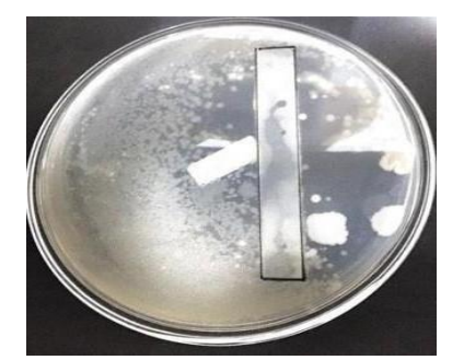
Figure 2. The results of the Bioautography of fraction ethilacetat to the Pseudomonas aeruginosa

The ethyl acetate chromatography plate was then placed on the surface of the agar media which had been inoculated with the pseudomonas aeruginosa bacteria, left for 30 minutes, then the chromatography plate was removed and removed from the surface of the medium. After making observations there is a clear zone on the media so that it indicates the presence of inhibition against the tested bacteria. In this monitoring, the Rf is 0.81. The spots are proven to inhibit the growth of the tested bacteria. The compounds that play a role in antibacterial activity are thought to be tannin.