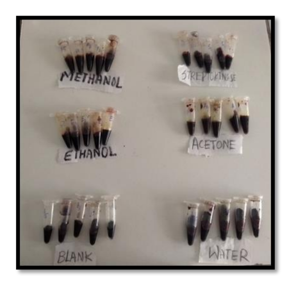
Figure no 1: Extracts after clot lysis