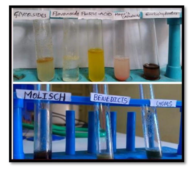
Figure no 2: Phyto-chemical evaluation of