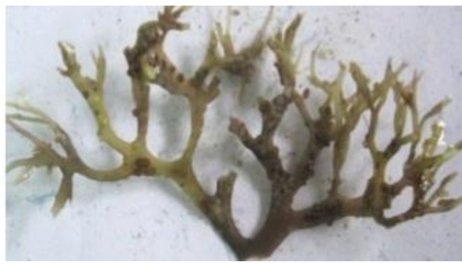
Fig.1. Photograph of Gracilaria corticata J.Ag.